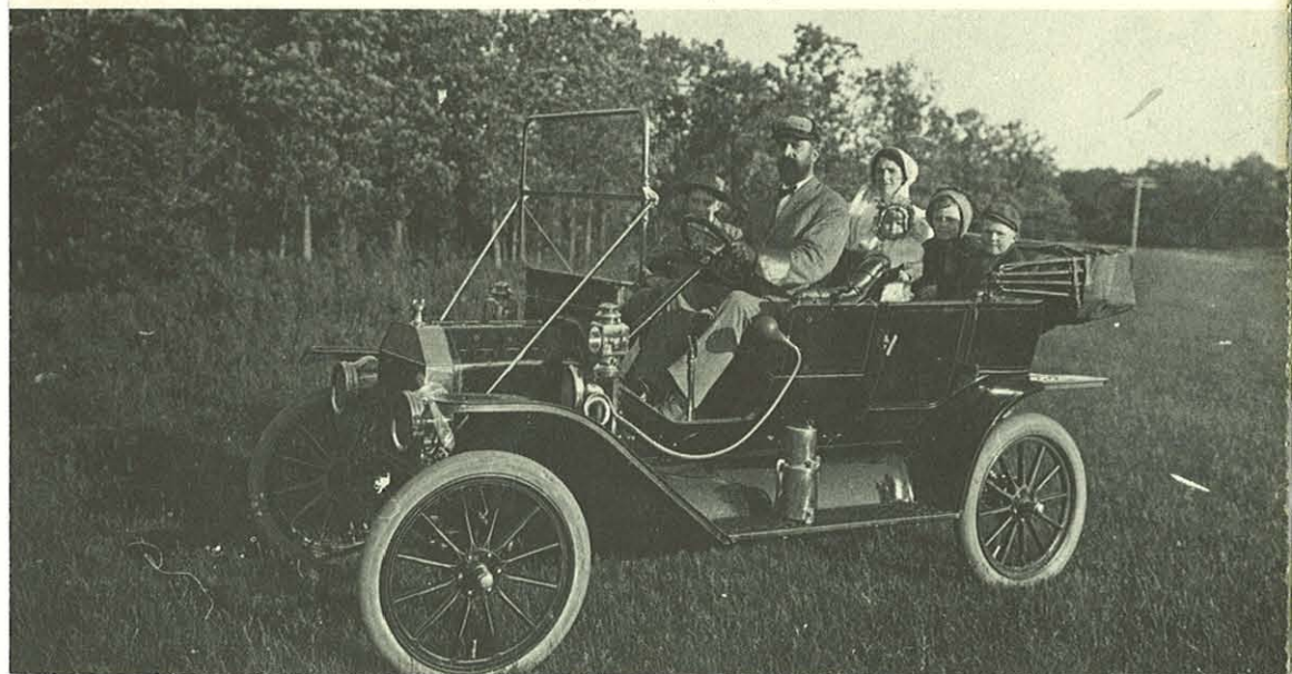
Judge Himsl family