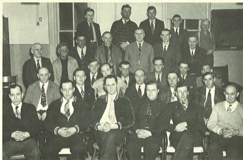
Workmen from St. John's