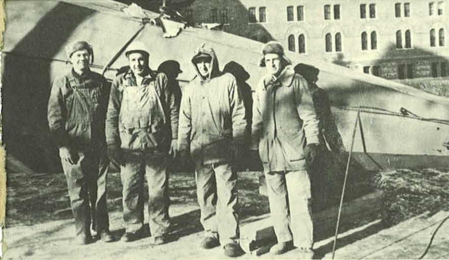
Taking down twin towers