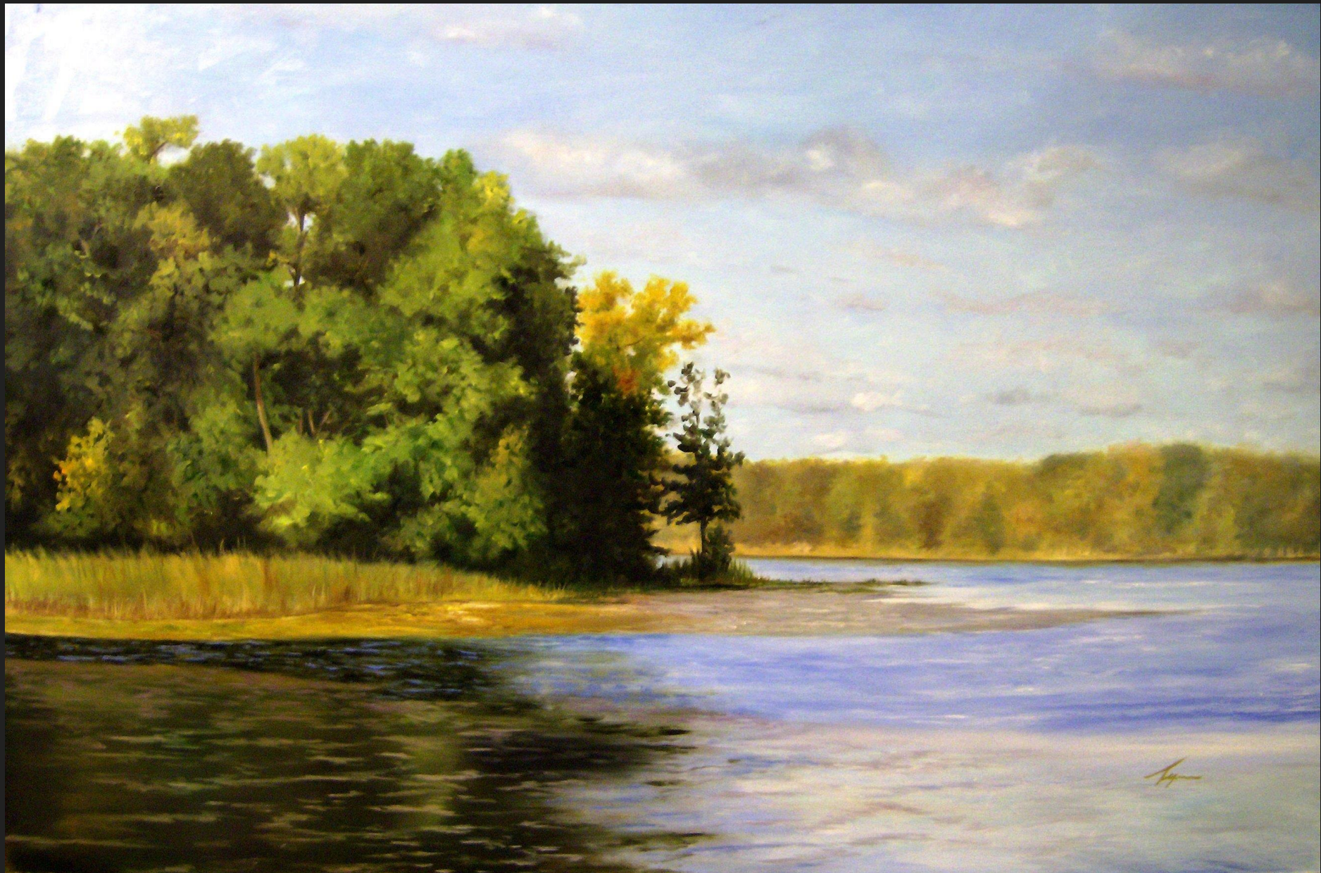
Island Lake, St. Joe