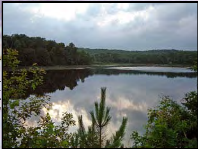
Schmid Lake in Avon Township.