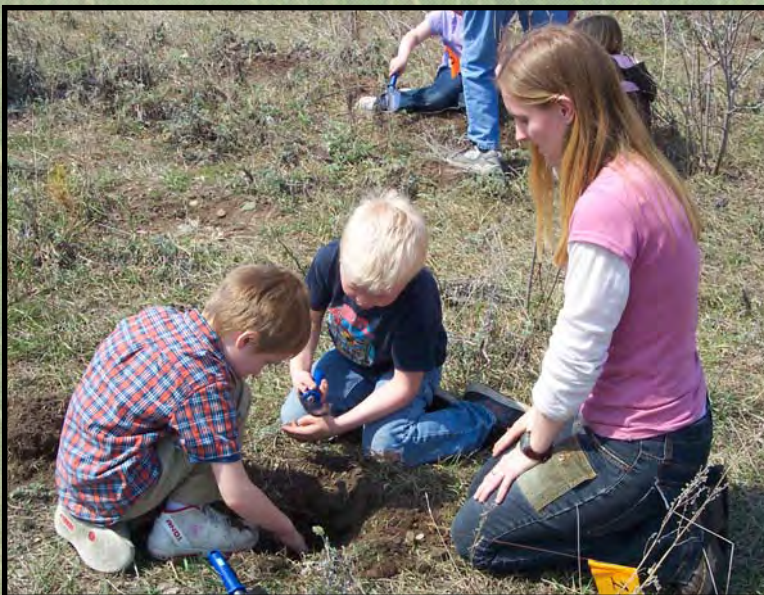
Young tree-planters at the Arboretum.