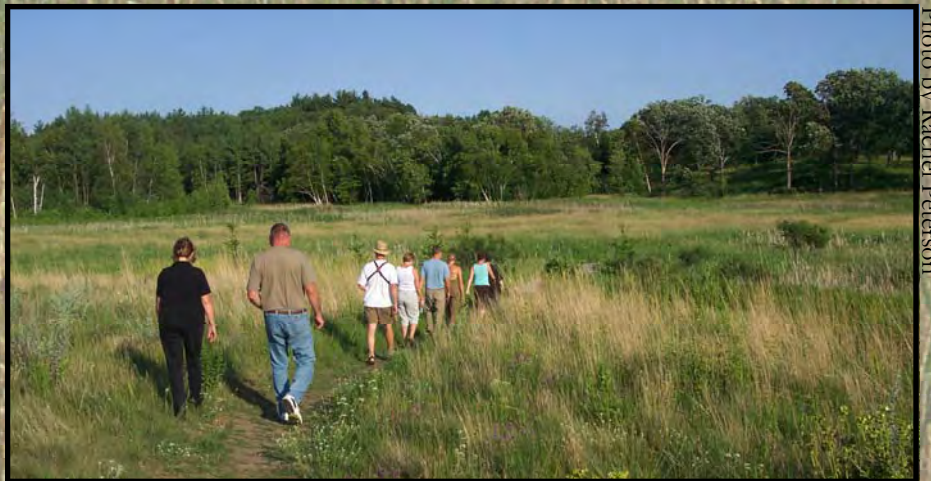
Arboretum members and friends on a wildflower walk.