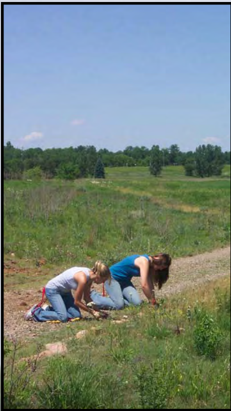
Students help maintain the prairie.