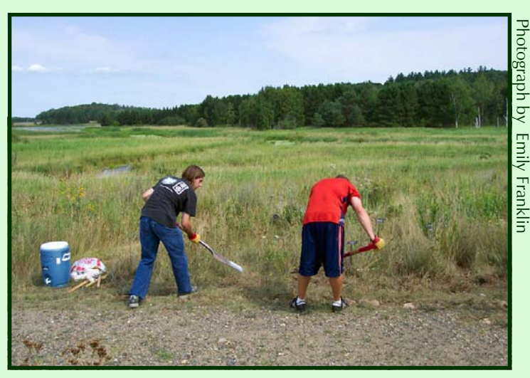
CSB/SJU student volunteers work diligently on the prairie garden

Students serving on the advisory council come from the CSB/SJU senates and will rotate on an annual basis.