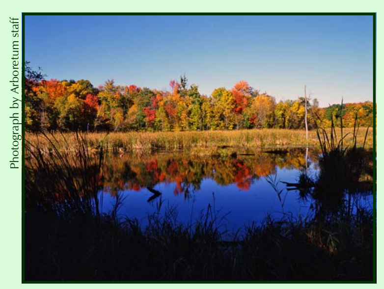
Brilliant fall colors at Saint John's Arboretum

We are also actively involved in the management of invasive species such as European Buckthorn and Absinth Wormwood which out-compete native plants and degrade native habitats.