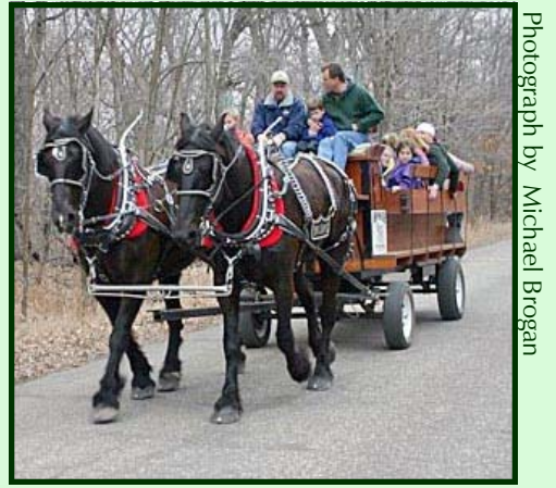
A load in the wagon, Maple Syrup Festival, 2005

Community (workshops, seminars) Fiscal Year 2005: 1,888 participants Fiscal Year 2004: 1,353 participants Fiscal Year 2003: 1,013 participants