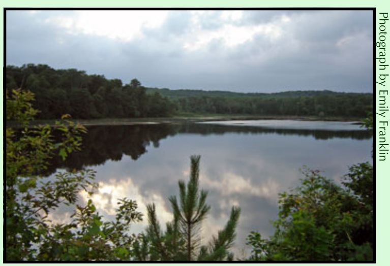
Summer on Schmid Lake in Collegeville Township, June 2005

For more information visit: http://www.csbsju.edu/arboretum/avonhills