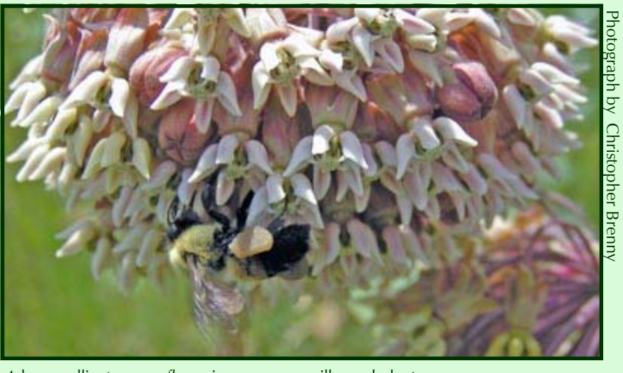
A busy pollinator on a flowering common milkweed plant.

In order to retain our green certification under guidelines set by the Forest Stewardship Council, we must harvest our timber sustainably, which means not harvesting more than 100% of our harvestable trees. The harvest this year focused on improving the overall health of the forest. An emphasis was placed on assuring older oaks will withstand defoliation when gypsy moths arrive in 5-15 years.