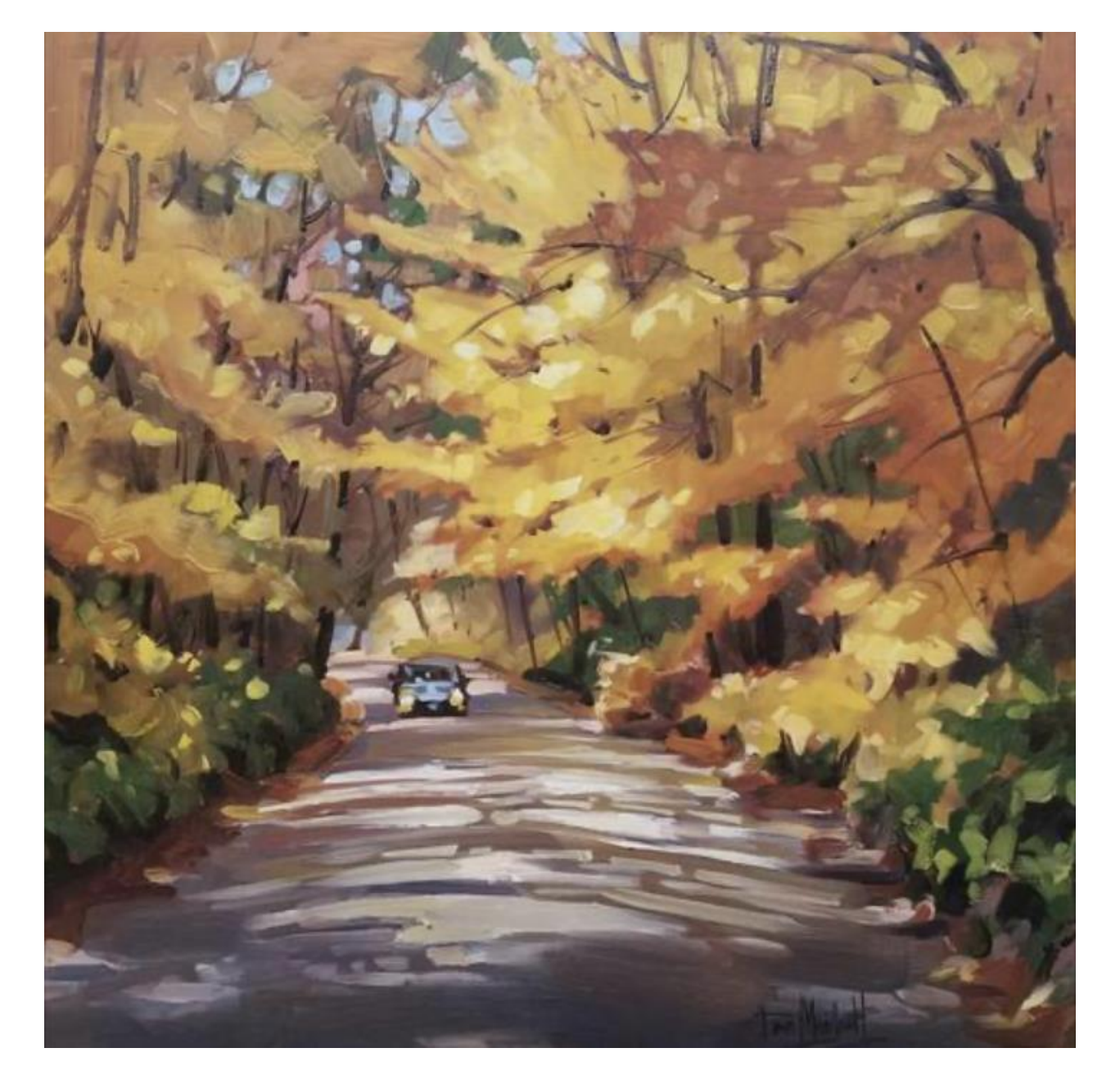
Schumann Lake RD, AKA Tunnel Road - Oil