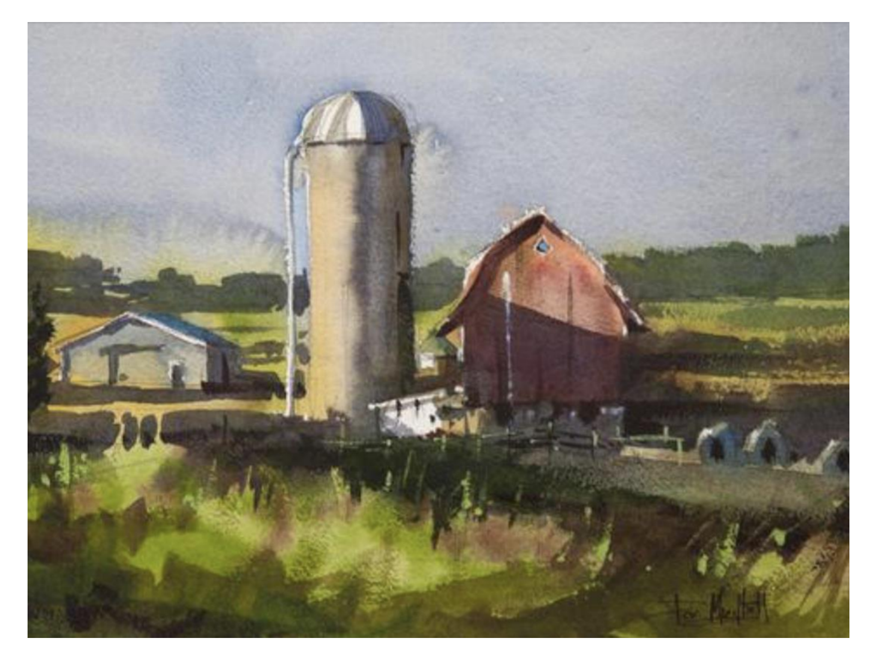
Morning Arrives - Watercolor