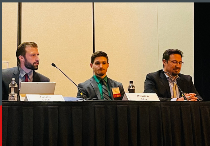
Wiring the Rez-Braden Orr