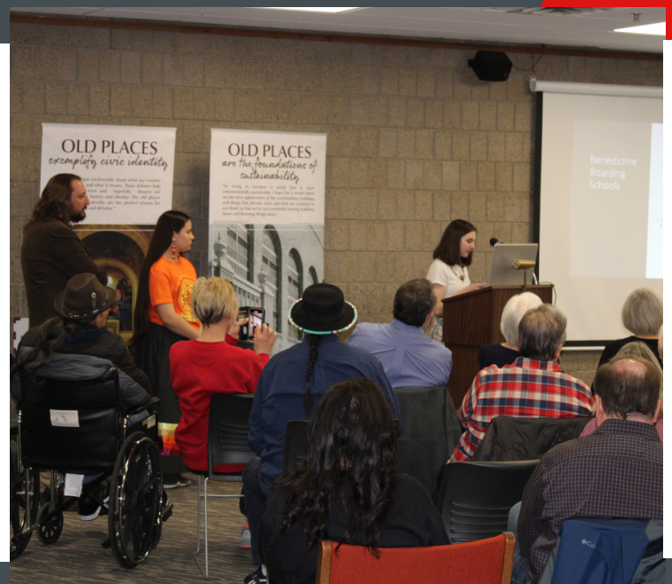
Stearns History Museum presentation