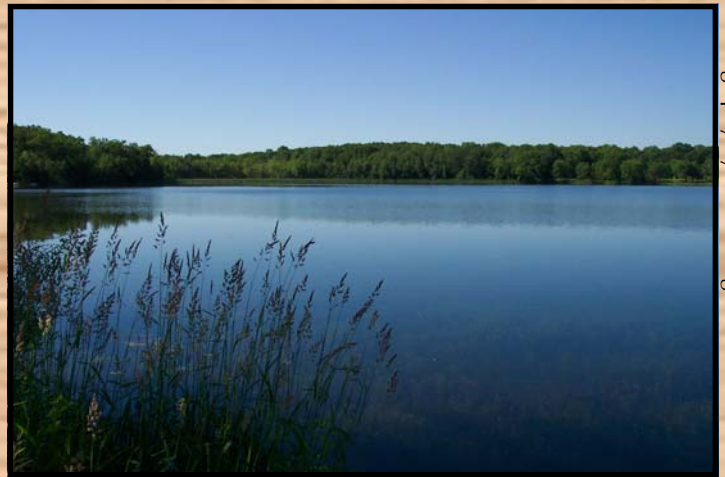
Summer evening on Achman Lake in Avon Township, June 2005

The Avon Hills Initiative continues to move forward in its efforts to establish dialogue between citizens and government. To this end, two Avon Hills Initiative executive officers have accepted positions on the Stearns County Comprehensive Plan review group. This group will review the state of the county and establish goals for future development.