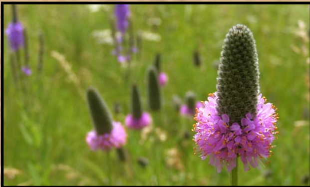
Purple prairie clover in bloom