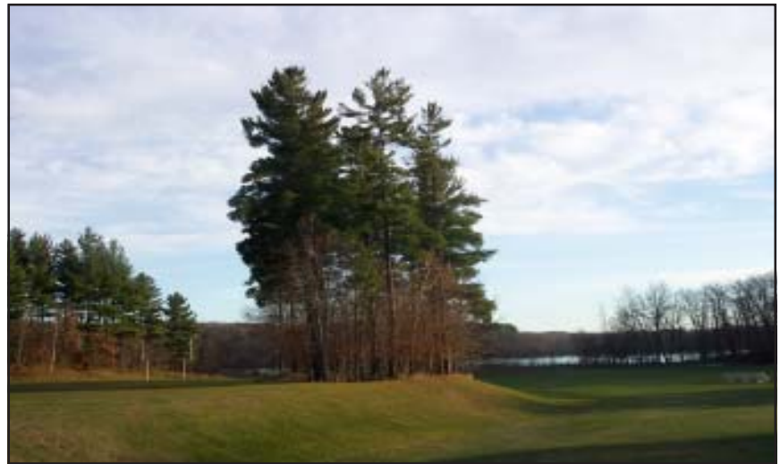
Pine plantation.

2003 is only the most recent year in a history of land management at Saint John's lasting more than 140 years, started by the first Benedictine monks to settle at the Indianbush. We're pleased to report continued planned harvests and reforestation in the woods. We also completed prescribed burns totaling 40 acres to improve natural regeneration of oak in the shelterwood and grasses in the prairie. Our floating boardwalk across the wetlands receives extensive use by humans and animals alike since being added to our trail system in 2000. The Arboretum was certified in June 2002 as a well-managed forest by Smartwood due to the health of the woods and the sustainability of our logging practices ( www.smartwood.org ).