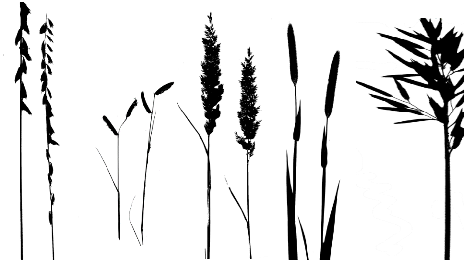
Some Common Grasses (from the left) – Bouteloua curtipendula , Bouteloua gracilis , Koeleria cristata , Phleum pratense , Bromus inermis