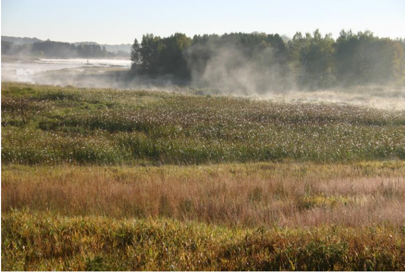
Figure 4. The prairie and wetlands at Saint John's.