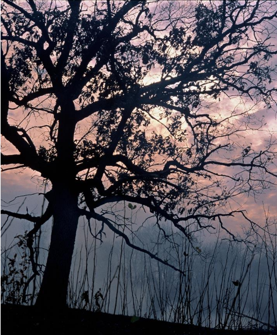
Figure 3. The Saint John’s savanna.

The diversity of the Saint John’s prairie is especially remarkable considering that little, if any, prairie existed on campus when the monks arrived. Although prairie is the dominant vegetation type south and west of Collegeville (Fig. 1), little evidence for the presence of much upland prairie at Saint John’s is found in either land survey records or early writings of monks on campus. While land survey notes from the 1850s commonly mention “meadows,” in the area, these are almost always associated with lake, swamp, or stream margins, and may represent a description of wet sedge meadows. Land survey records from known prairie regions in Minnesota generally include comments about mesic prairie as “fine tillable” or “arable” prairie land, as well as references to