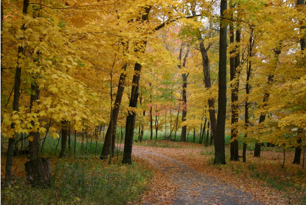
Figure 2. The Saint John's sugarbush in autumn.

Collegeville lies in the Eastern Broadleaf Forest Province of the state that roughly runs from the southeast corner of the state to the northwest corner near Lake Itasca (Clearwater County). This province, which is characterized by deciduous trees, forms a transitional zone between the coniferous forests to the northeast and the prairie to the west and south. Collegeville lies on the southern fringe of the province in an area known as the Hardwood Hills ecological subsection. It is characterized by hummocky moraines that were deposited at the end of the last glacial period. Forests in this region are mesic to dry and dominated by northern red ( Quercus rubra ) and white ( Quercus alba ) oaks. To the south, the area known as the Big Woods forest type (subsection) once extended from northern Wright County southeast to Rice County (Fig. 1). Although only remnants of this great ecosystem remain, some of the forest areas at Saint John's are strikingly similar to the Big Woods. In fact, the deciduous forests of Saint John's form a collage of forest subsets and are an interesting mixture of both.