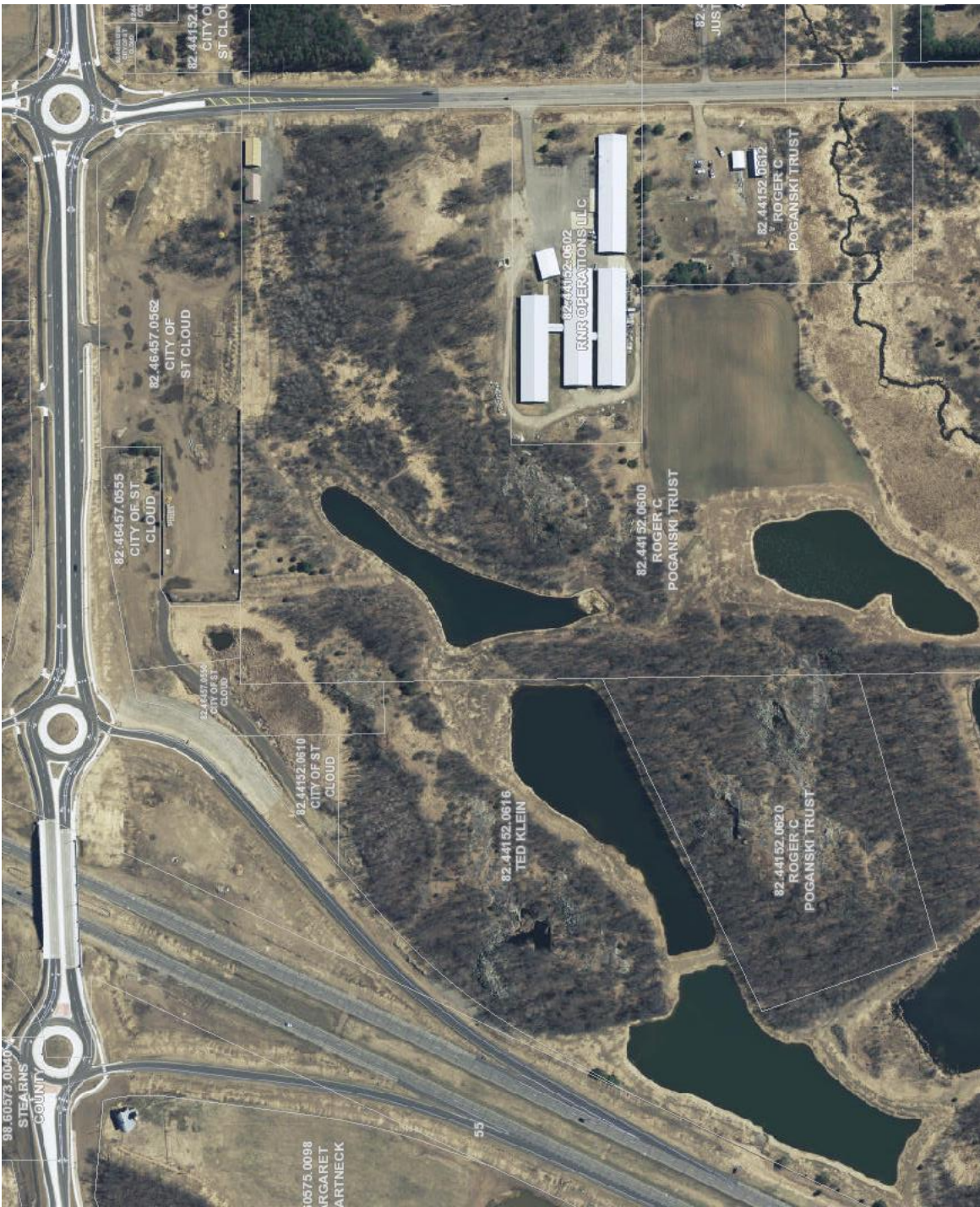
Figure 2. Aerial view of Sites 78 & 104 from the Stearns County Landuse Map. Accessed at https://gis.co.stearns.mn.us/Landuse-Restriction/default.aspx on December 13, 2017.