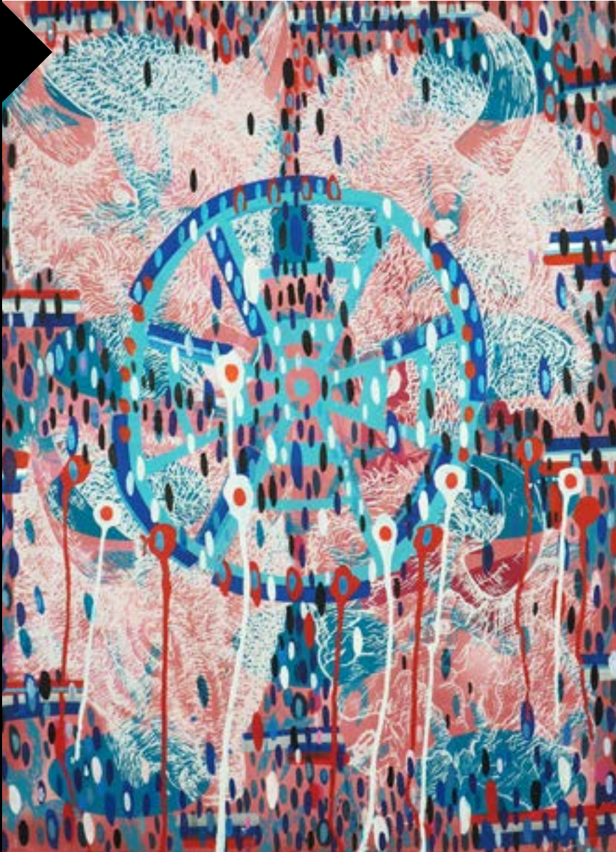
Visual Arts Series John Hitchcock - Esa Rosas screenprint, acrylic paint, dye on paper