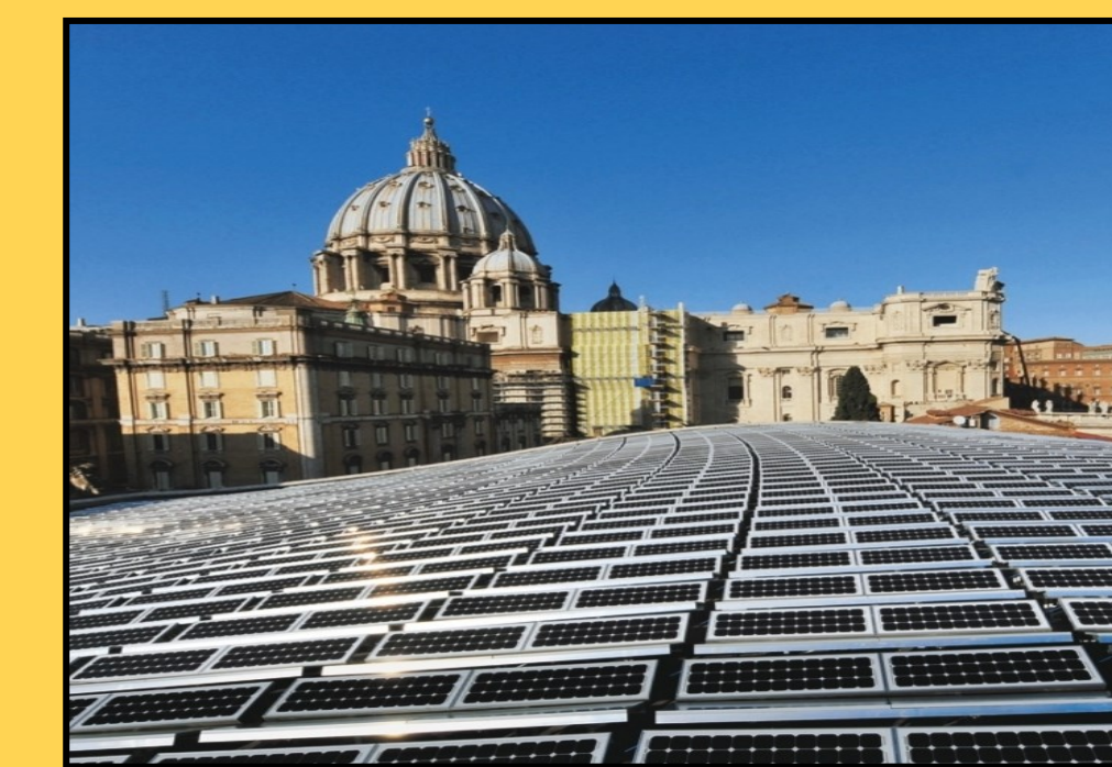
Vatican City has over 24,000 solar panels