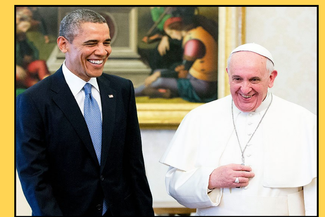
Pope Francis and President Obama