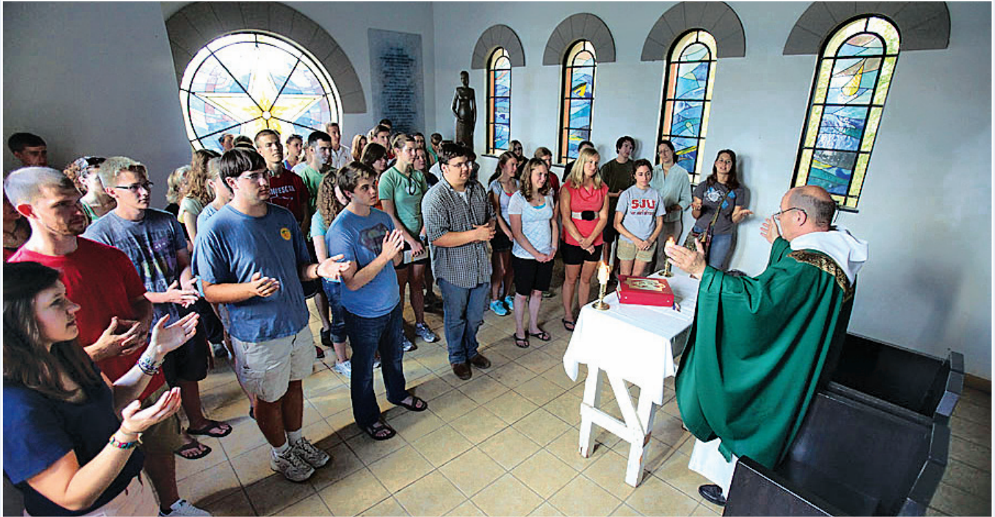
Saint John's and Saint Benedict students share a spiritual moment in the Stella Maris Chapel on the shore of Lake Sagatagan. Distribution of the Benedictine message has been diversified in the 21st century by the formation of the Benedictine Volunteer Corps and Benedictine Institute.

faculty and staff – to provide vibrant new direction as supplemental messengers for Benedictine thought in a world with fewer monastics.