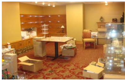
SBSC Gift Shop.