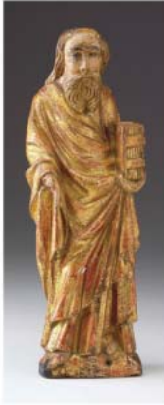
15th Century woodcarving depicting St. Paul, currently on display in Alcuin Library.

play. The exhibit runs now through October 2002, and is free to the public during regular library hours. Guided tours will be offered on Sept. 19 and Sept. 26 at 4:00 PM.