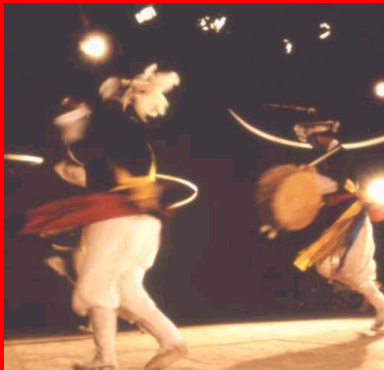
SamulNori players perform sangmo (ribbon dance).