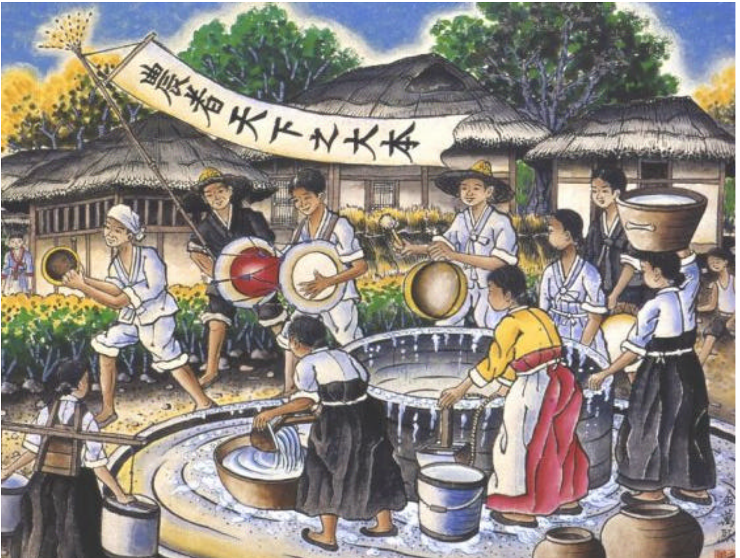
A farmers' band is led through a village by the banner bearer whose sign proclaims the importance of farming.

SamulNori is a combination of the Korean words Samul (to play) and Nori (four things). The four things are instruments including the k'kwaenggwari , ching , changgo , and buk style drums. SamulNori combines the tradition of farmers' bands with that of traveling entertainers called Namsadang .