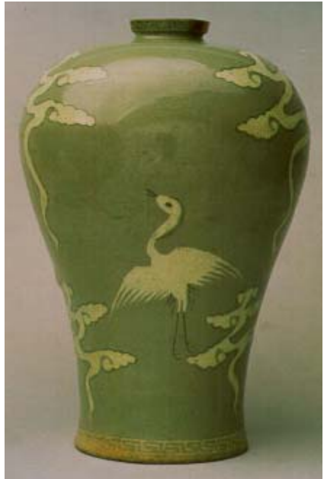
Koroyo dynasty vase, 13th-14th century Celadon with inlaid crane and cloud design The Metropolitan Museum of Art

Set in the potters' village of Ch'ulp'o, it is the story of Tree-ear, an orphan boy who is determined to become a great potter. The fulfillment of Tree-ear's dream is tied to a single shard of celadon pottery. The historical novel informs readers about traditional Korean pottery-making during the twelfth century.