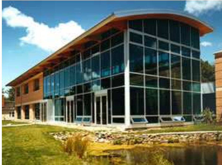
Adam J. Lewis Center for Environmental Studies, Oberlin College