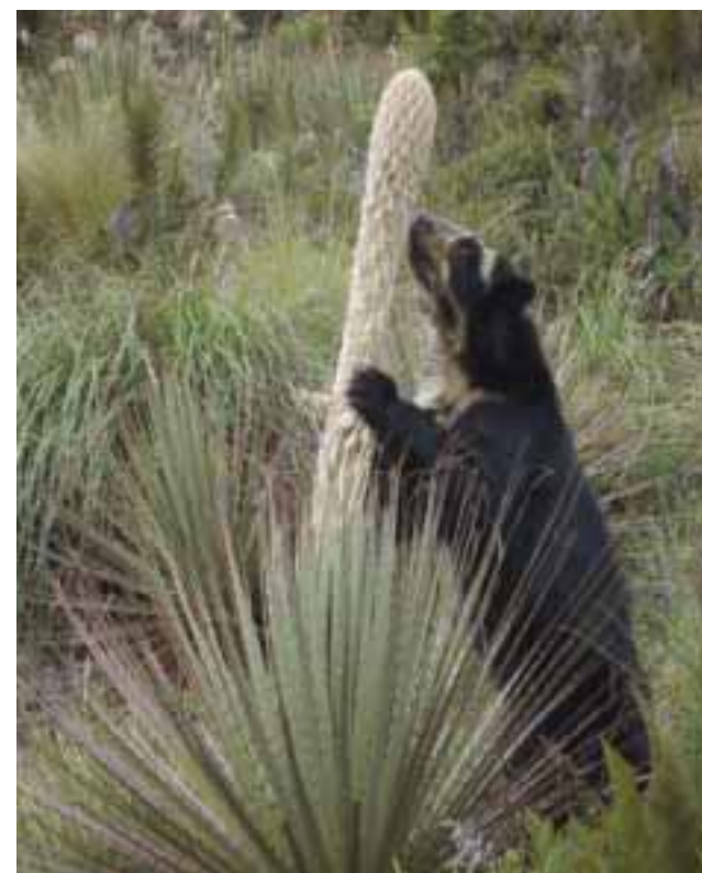
An Andean bear climbs a puya plant.

This research is more than bears and biology; it is a lifetime experience. They, definitely, were not in Kansas anymore.