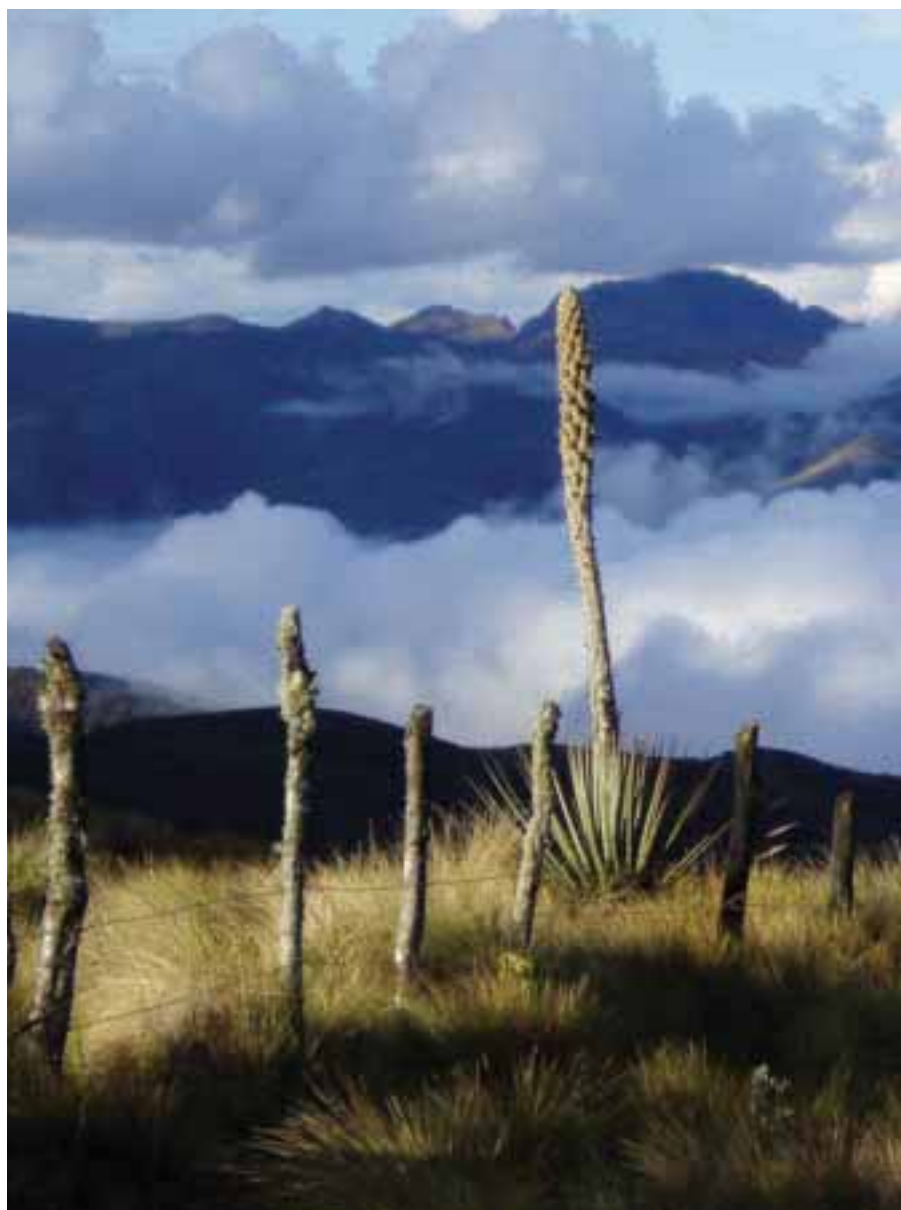
The research team enjoyed stunning views of the Andean mountain ranges as part of their summer